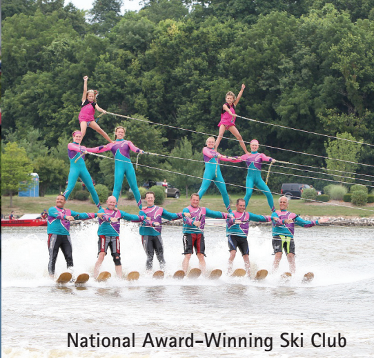
National Award-Winning Ski Club