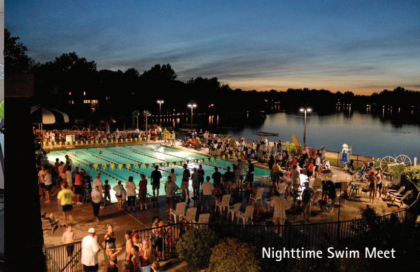
Nighttime Swim Meet