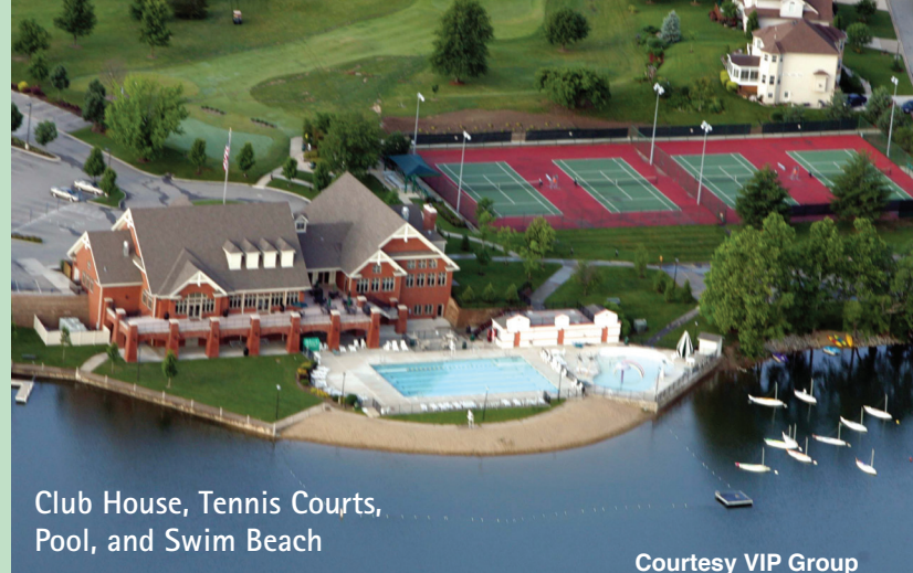
Club House, Tennis Courts, Pool, and Swim Beach

The LSLCA amenities are private and for the exclusive use of Lake Saint Louis Community Association residents and their guests.