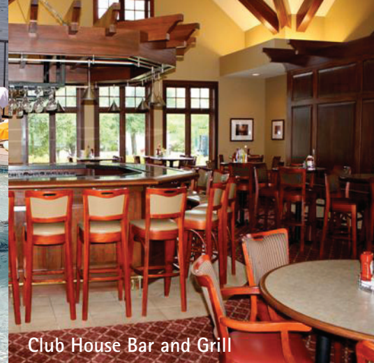
Club House Bar and Grill