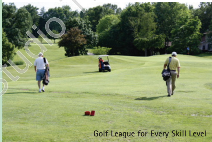
Golf League for Every Skill Level

Where a Lifetime of Memories are Made Every Weekend