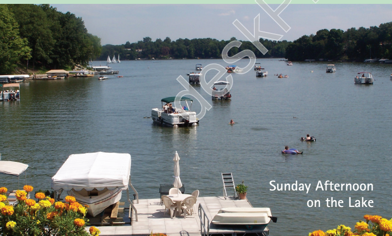
Sunday Afternoon on the Lake