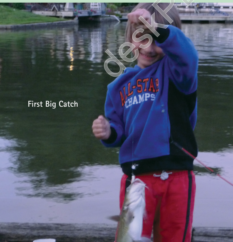
First Big Catch

Don't be left out! If the LSLCA is your choice for raising your family or for your retirement, ensure the property you are looking to purchase is in the boundaries of the LSLCA by contacting the LSLCA Business Office at 636-625-8276.