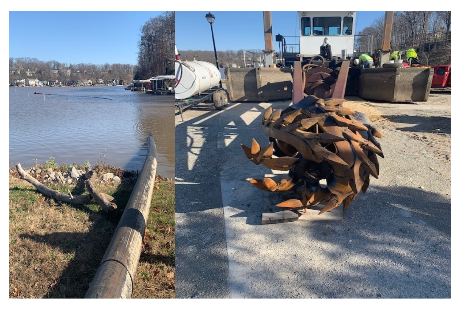
2020 Dredging Photos